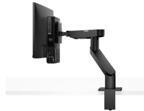
OPTIPLEX MICRO DUAL VESA MOUNT WITH ADAPTER BRACKET

This mount allows the Micro to be VESA mounted to select Dell E Series displays.