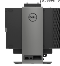
OPTIPLEX SMALL FORM FACTOR ALL-IN-ONE STAND

Minimize your footprint with this arm that offers easy installation and enhanced adjustability while keeping cables neatly hidden from view.