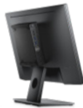
OPTIPLEX MICRO ALL-IN-ONE MOUNT FOR DELL E SERIES MONITORS

Small footprint mounting solution adapts to your environment, with cable management and monitor height adjustability, tilt, swivel and pivot functions.