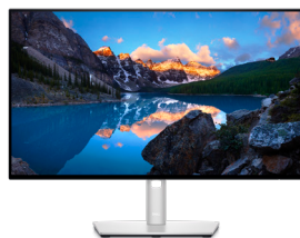
DELL ULTRASHARP 24 MONITOR | U2422H

See more and do more with a 27" QHD monitor that expands your workspace and gives you a better view of all your important tasks.