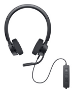
DELL PRO WIRED HEADSET | WH3022

Wired mouse with fingerprint reader offers convenient and secure login and online access without passwords.