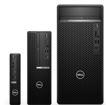
OPTIPLEX DUST FILTERS

Thermally tested custom cable covers offer an easy to install and attractive way to manage cables and secure ports.