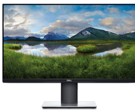
DELL 27 MONITOR | P2720D

See more and do more with a 27" QHD monitor that expands your workspace and gives you a better view of all your important tasks.