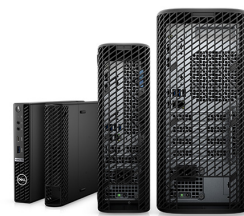
OPTIPLEX CABLE COVERS

Experience exceptional audio clarity with this Teams certified wired headset that allows you to wear the microphone on either side for a customized fit.