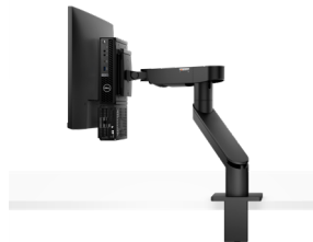
DELL SINGLE MONITOR ARM | MSA20

Mount your system on a wall or under a desk. Includes an adapter box to securely house the system's power adapter.