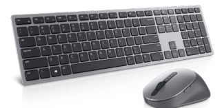
DELL PREMIER MULTI-DEVICE WIRELESS KEYBOARD AND MOUSE | KM7321W

Minimize background noise while on calls with the dual mic array and echo cancellation feature.