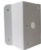
DS-1276ZJ Corner Mounting Bracket