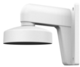
DS-1272ZJ-110-TRS Wall Mounting Bracket